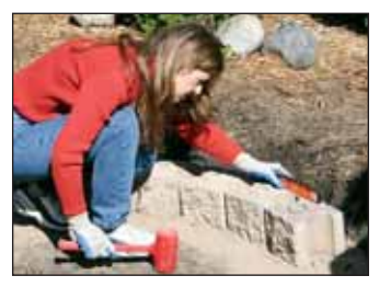
Install and align first course, stack additional courses to desired height.