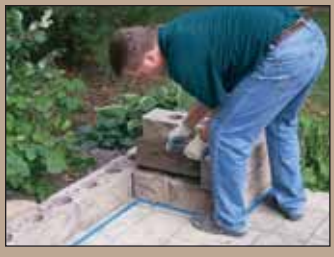
Stack additional courses to the desired height.

Building on a pre-existing foundation, like pavers or a concrete slab, makes building with the AB Courtyard Collection that much easier. Just stack the blocks, glue the caps down and you are done. Simple enough to complete in a weekend.