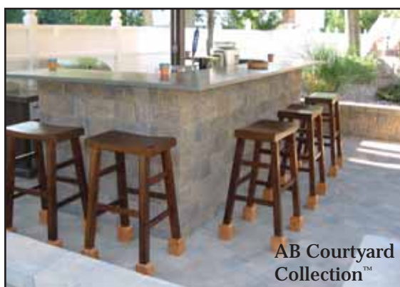
AB Courtyard Collection™