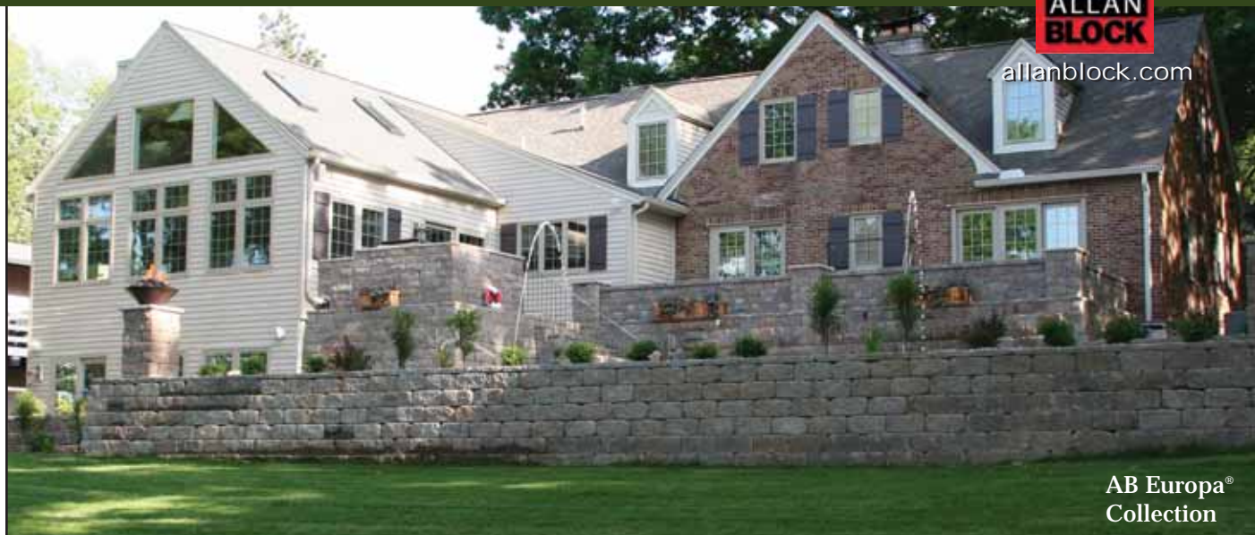
AB Europa® Collection