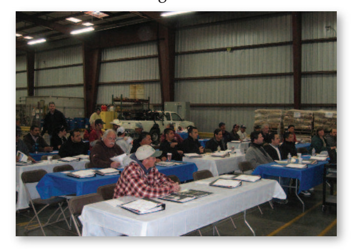
Be confident in the projects you build.