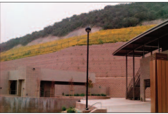
San Diego Jewish Academy, Calif.

Within the Segmental Retaining Wall industry, Allan Block has been one of the leading resources since the beginning of modular block walls. As an industry leader, Allan Block refers to AASHTO to decipher seismic design requirements for SRWs. In addition, the National Concrete Masonry Association (NCMA) and Federal Highway Administration (FHWA) also refers to AASHTO for guidance on