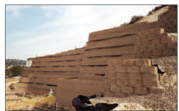
San Diego Jewish Academy, Calif.

The NCMA goes on to limit the A<sub>s</sub> value to 0.45g within their Design Manual for Segmental Retaining Walls, 3rd edition if deflection is equal to 0 inches. This is provided in Section 9.4: